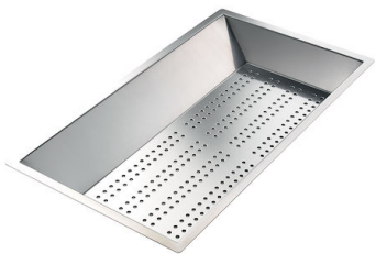
Stainless steel perforated tray 8151 000 * only in combination with the accessory 8644 101