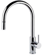
Mixer Tap Camillo 8467 000