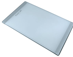
Glass chopping board 8631 300