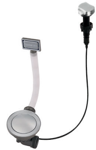
Space automatic waste fitting - PE 8407 109