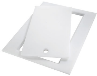
HPDE Twin chopping board 8644 101