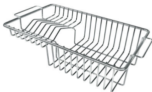
Stainless steel plate rack 8100 201