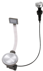
Space Milano automatic waste fitting 8407 115