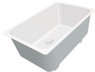
White bowl 8153 100