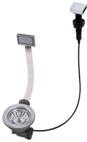
Automatic waste fitting - PM 8407 113