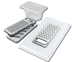
Graters kit with ring-holder and food collection tray 8159 101 * only in combination with the accessory 8644 101