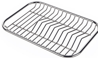
Stainless steel plate rack 8100 154