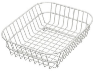
Cestello inox 8612 000