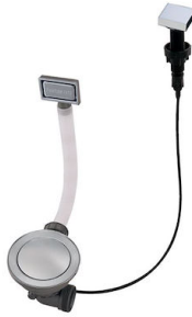
Space automatic waste fitting - PA 8407 108