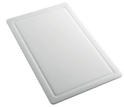
HPDE Chopping board 8657 001