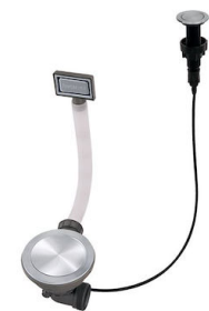
Space Push automatic waste fitting - PP 8407 116