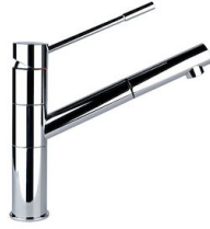
Mixer Tap Lorenzo 8466 000